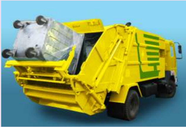
GA DRAWING OF 7 cum COMPACTOR ON AL10.12